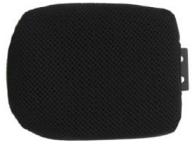
X-Large 4in. Height x 6in. Depth