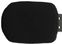
Medium 3in. Height x 4in. Depth