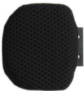
Small 3in. Height x 3in. Depth

Lateral Supports are not compatible with Fixed ELITE mounting hardware.