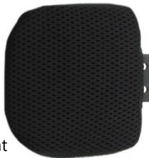
Large 4.5in. Height x 4.5in. Depth